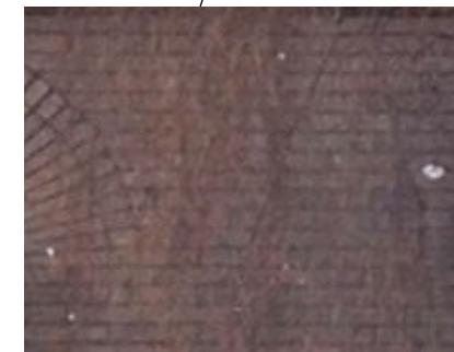
Brick Base (Williams House)