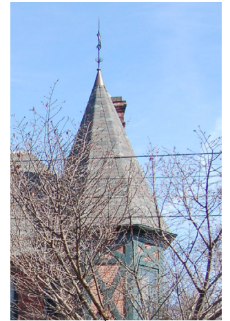
Corner Turret (W.H. Miller House)