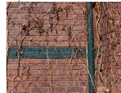
Brick Band Course (W.H. Miller House)