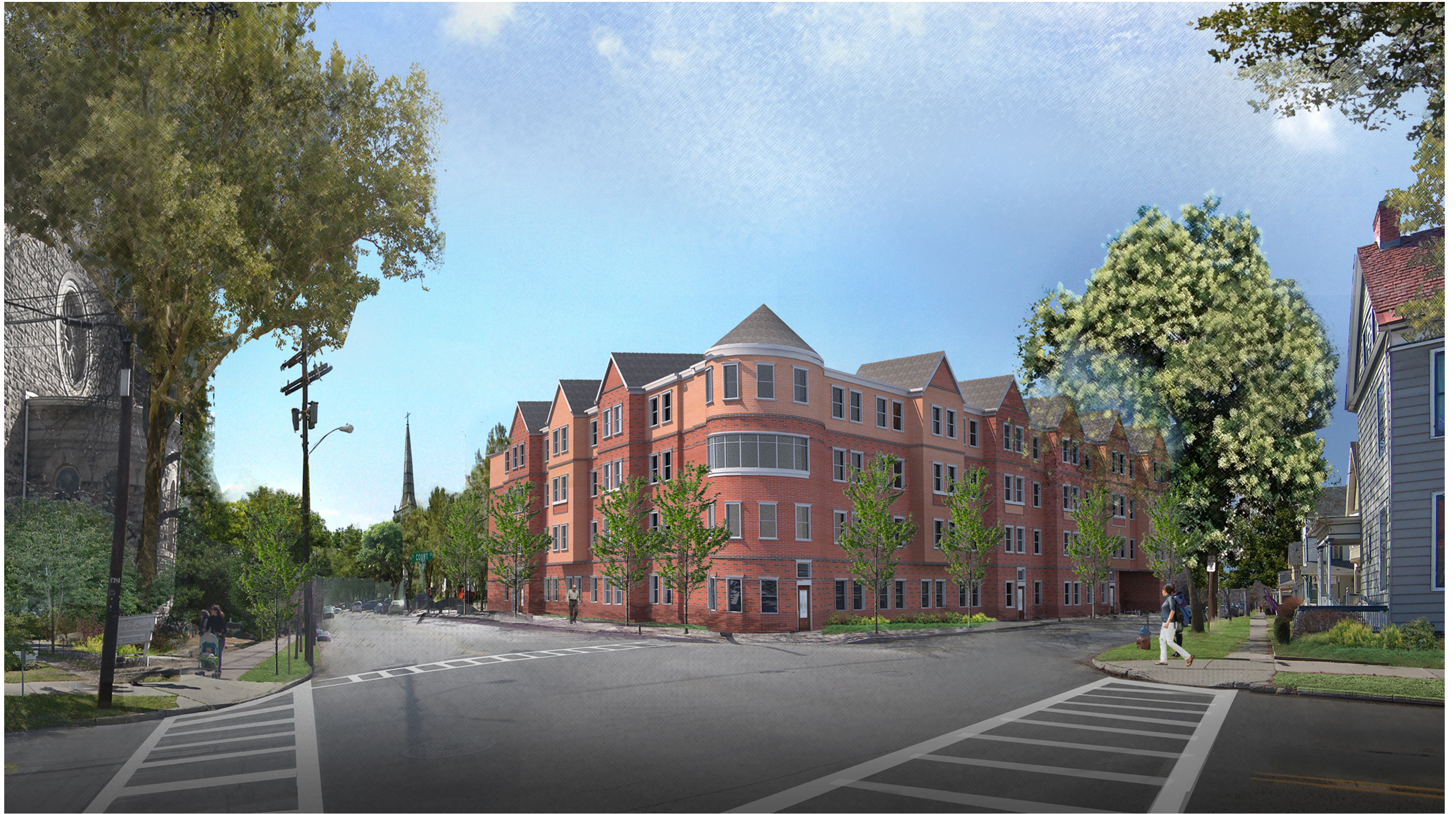
View from Corner of Cayuga and Court Streets