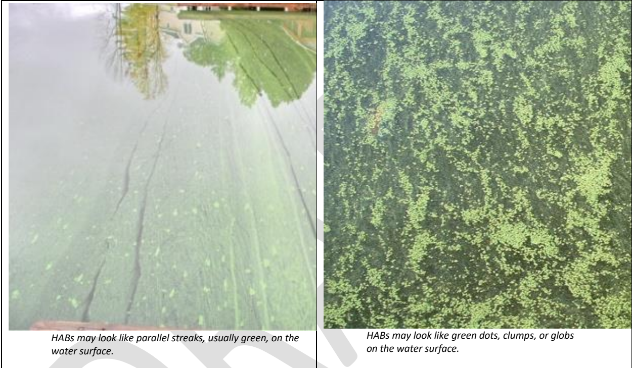
Figure 5.4.5-1. Examples of Harmful Algal Bloom Visual Appearance

The appearance of HABs can vary greatly. According to the NYSDEC, colors can include shades of green, blue-green, yellow, brown, red, or white. The physical appearance of these blooms can include floating dots or clumps and streaks on the water's surface as illustrated in Figure 5.4.5-1. Some blooms can also resemble spilled paint on the water's surface or change the appearance of water to that of pea soup (NYSDEC 2017a).