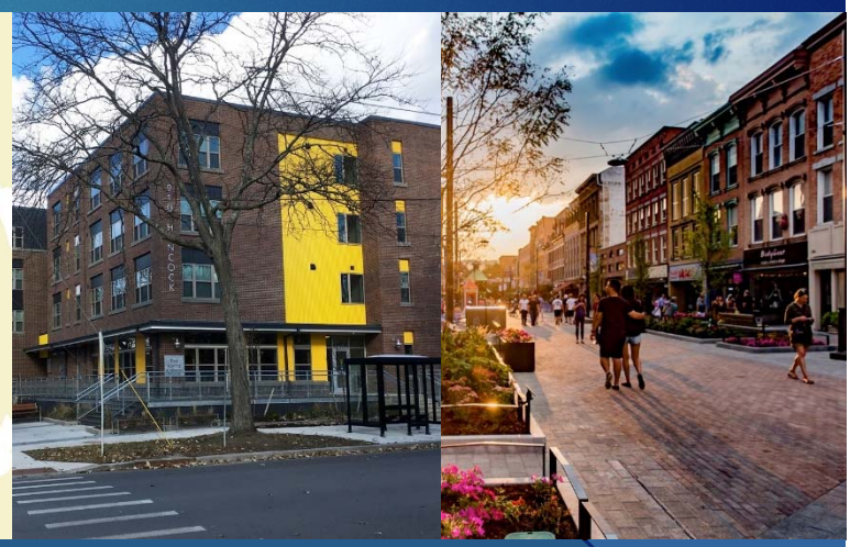
Tompkins County Area Development - 2020 Budget