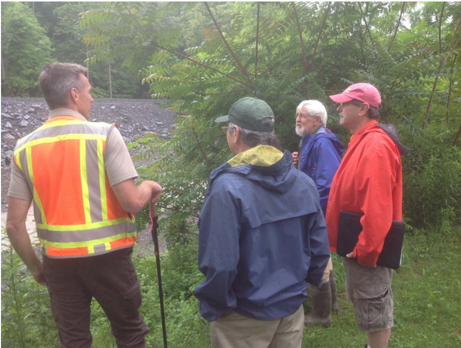
Stream Corridor and Flood Hazard Technical Advisory Committee Site Visit