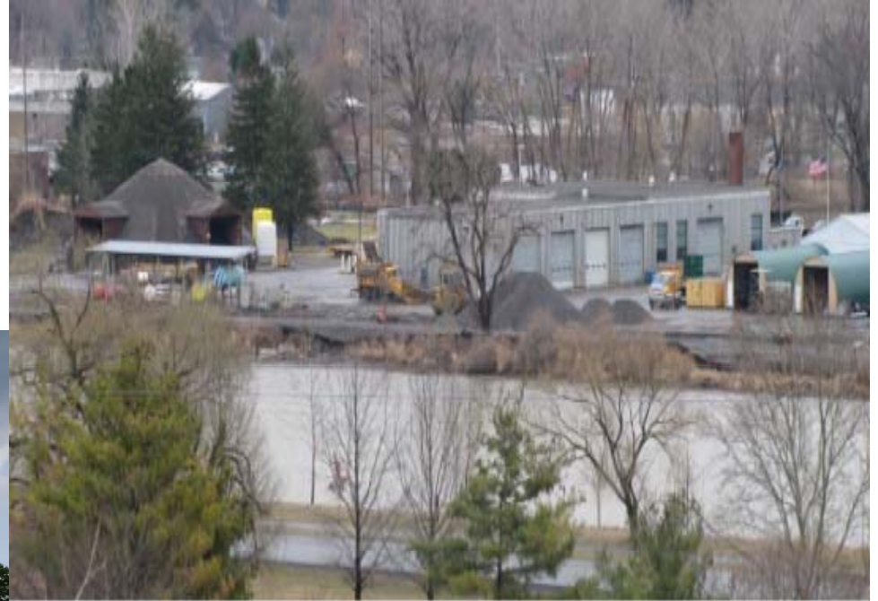
Relocation of DOT Facility