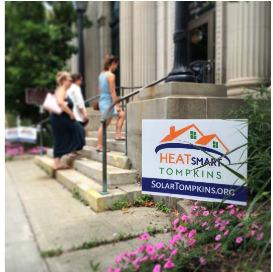
HeatSmart Tompkins 2015-2016