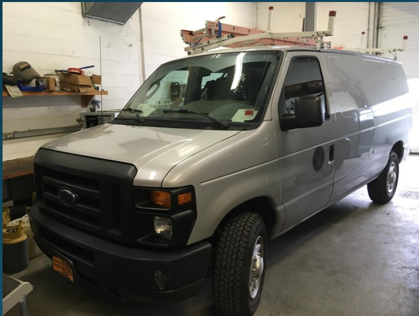
Existing 12 yr. old Van

OTR will allow for replacement of existing 12 year old vehicle that has exceeded its service life and is in poor condition. The van will be used by our HVAC Systems Technician that services all County facilities. This OTR is also for regular replacement of staff computers and regular building repairs.