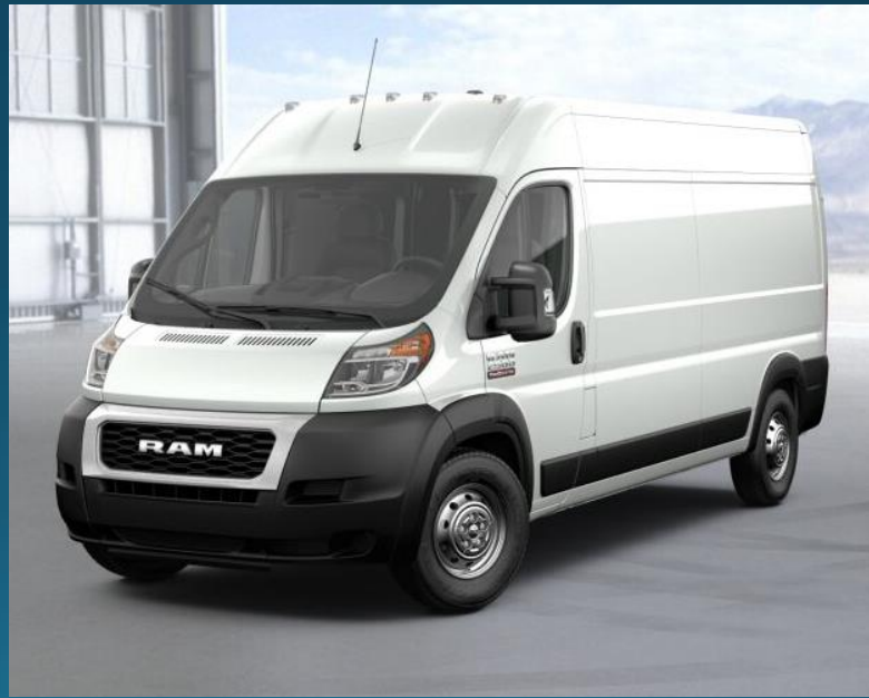
Proposed new Van